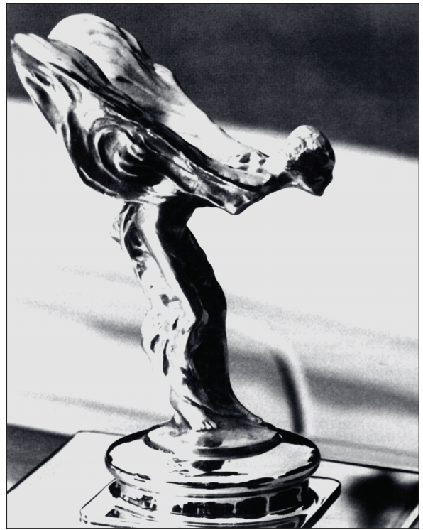
While originally part of the radiator cap, the Rolls-Royce “Flying Lady” mascot hood ornament has features suitable for simultaneous protection as a registered trademark, a copyrighted sculptural work and a patented design.

This pamphlet summarizes the principal attributes of these various types of protection.