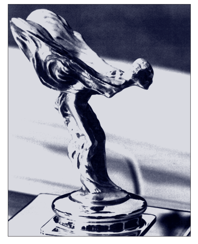
While originally part of the radiator cap, the Rolls-Royce "Flying Lady" mascot hood ornament has features suitable for simultaneous protection as a registered trademark, a copyrighted sculptural work and a patented design.

This pamphlet summarizes the principal attributes of these various types of protection.